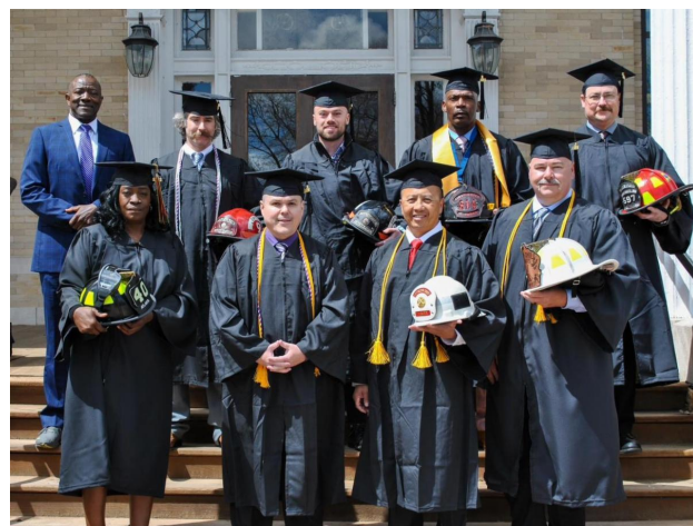
We had a number of Fire Science